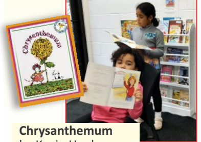
Chrysanthemum by Kevin Henkes ISBN-10 0688147321

Every child accompanying a parent can relax in the office and enjoy a book while we work on their vehicle. Many thanks to Clinic supporters who donate books for these children.