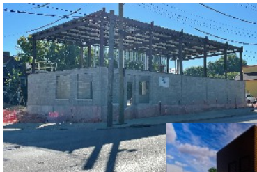
Metal for second story underway

As seen below, the Clinic's car repair shop is slowly taking shape. As of this newsletter, all of the first story block work has been completed, and the metal framing for the 2nd story is underway. The goal is to