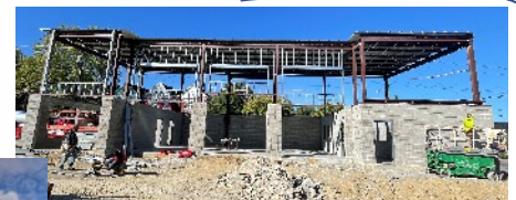
First story block wall completed

<<< progress at the corner of Madison Ave. & Martin St., Covington!