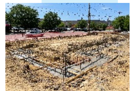
Footers and rebar