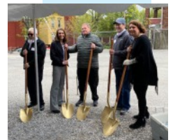
April 19, 2022 Groundbreaking

The Clinic is pleased to share that great progress is being made on the new shop location in Covington. As the photos to the right show, the concrete footers are now poured, and the rebar is in place for the foundation walls. What a welcome sight!